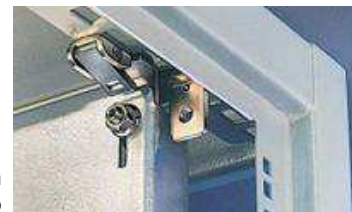
Attachment brackets with "snap-in device" at top