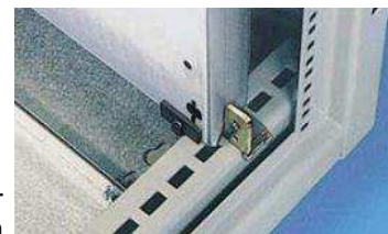
Plastic sliders on rails for easy movement at bottom